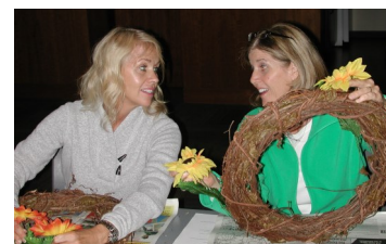
Craft Classes “Make & Take”