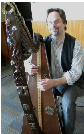
Clairseach Celtic Harp