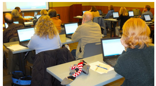
Computer Classes— taught by the Science Museum of MN