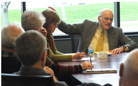
Great Decisions Discussions

Writers in the area have additional opportunities with three monthly Writer’s groups in the county—a group for aspiring authors and another group for published authors held at the Chanhassen Library and a group meeting monthly at the Waconia Library.