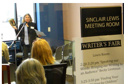
Writer’s Fair– workshops on writing for aspiring writers