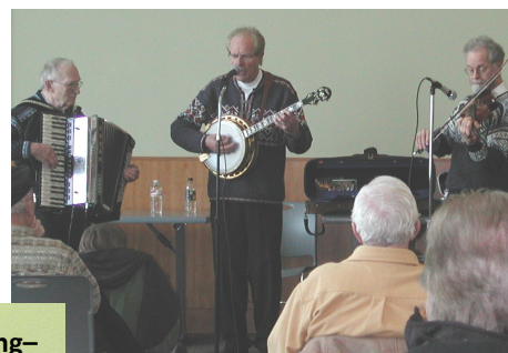
Minnesota Scandinavian Ensemble