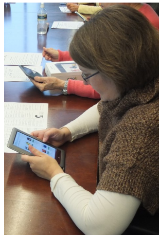
Library Advice for your Device Class